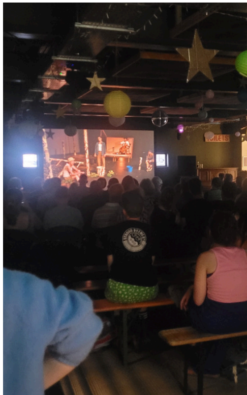
Three Words for Forest film showing in Stroud

Arts-led interdisciplinary research can investigate complex environmental questions and open spaces for positive dialogue / new understandings in polarised contexts.